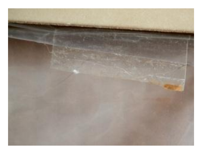
Beware the loose transparent tape!