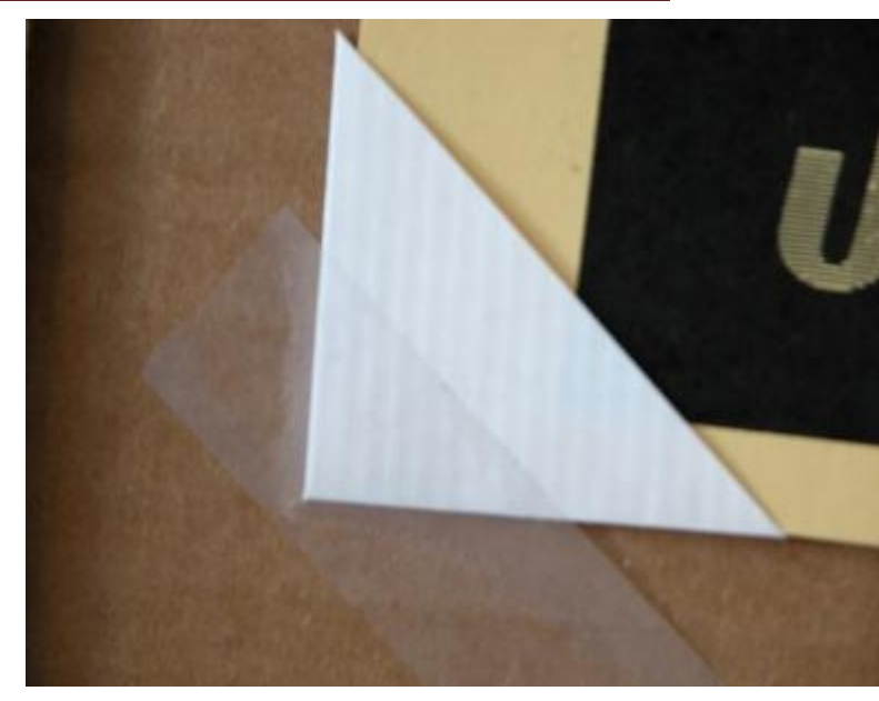
Mounting the corner

Using this method, the poster is securely held to the board by the four corners, but no tape touches the poster. Some put the poster in a clear plastic bag and then put the bag to the board, using the four corners method.