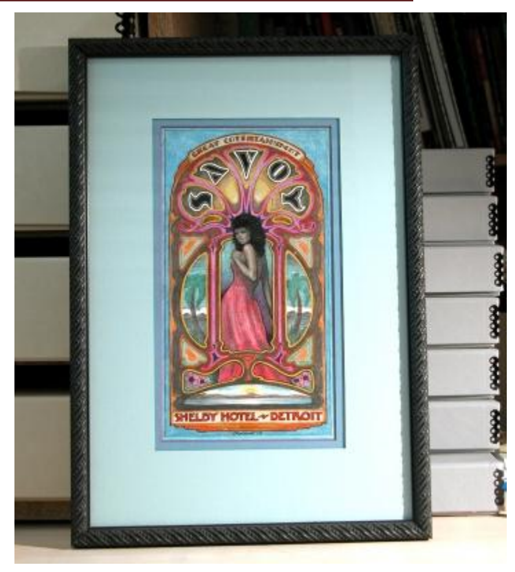
A Piece of Original Art, Matted and A Piece of Original Art, Matted and Framed

Matting -- The mat board is not simply cosmetic. It serves an essential function, that of keeping the glass or Plexiglas raised and away from the poster surface. It is important that the mat board be thick enough to serve this purpose. Always use archival mat board, which means the board will not chemically react to the paper/inks of the poster. Also, always make sure the mat is at least 3/4 inches larger than the poster itself, to allow for the natural expansion and contraction of paper with routine temperature changes.