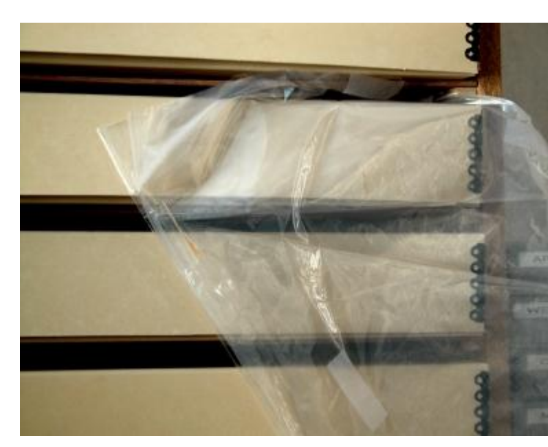
The maverick bag