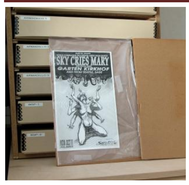
Dangers of tape and plastic So, be careful when you remove a posters from a taped bag!