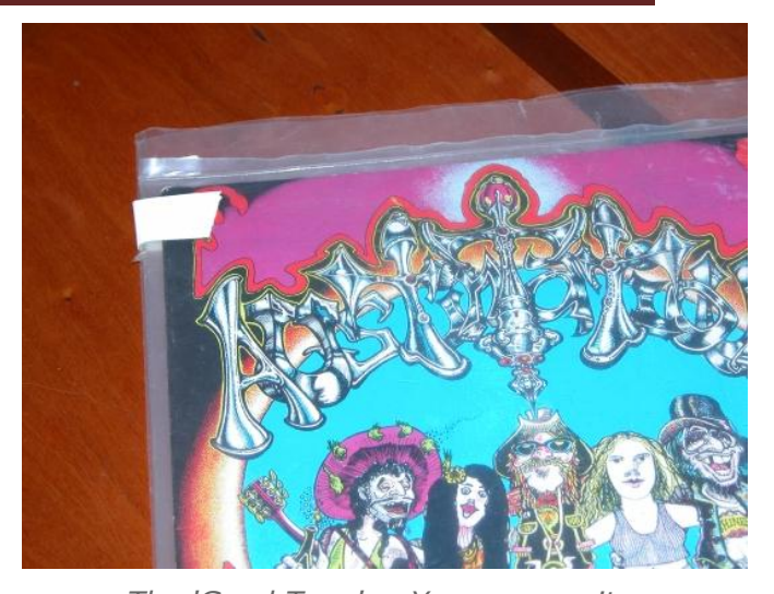
The 'Good Tape' -- You can see it. Another word of warning to those new to collecting. When you first start out, you don't have that many ways to store your posters. It is very tempting to want to somehow salvage these taped plastic bags and to reuse them for storage. This can be a big mistake. Those old tape ends can sneak up on you and grab at your posters. Just throw any bag that has had tape on it in the trash.