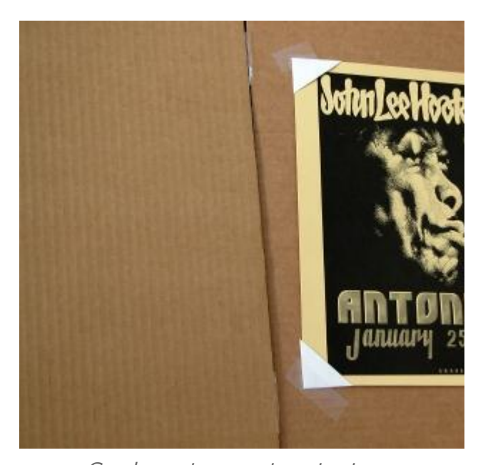
Good way to mount poster to board

The most common and a very safe way to pack posters is also very inexpensive and simple. You just take a common mailing envelope, and cut off the four corners. These corners are then used to position and hold the poster on the inside of the cardboard sheets. Place four cut corners of the mailing envelope over the four corners of your posters. Place the poster on the inside of one of the cardboard sheets and tape those corners (not the poster) to the board.