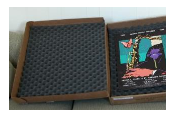
Custom Shipping Container

Here is a heavy-duty cardboard box that has custom-fitted pieces of foam, with protruding fingers. There is a foam piece above and below the posters. Where the fingers of the foam pieces meet is where you place the posters. The foam fingers press together to hold the posters, kind of suspended between the fingers. This kind of box works well if the number of posters is not too many. Too many posters, and the foam fingers cannot maintain a pressure, causing the posters to slide and bent corners result.