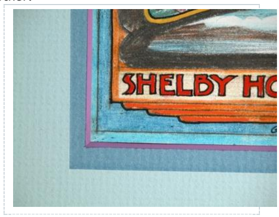
Double Mats raise the glass from the Poster Surface

It is perhaps sad, but seems to be true, that most (certainly many) collectors don't mat and frame all that many posters. They tend to squirrel their posters away from sun and eyeballs, confined to safe storage of one type or another.