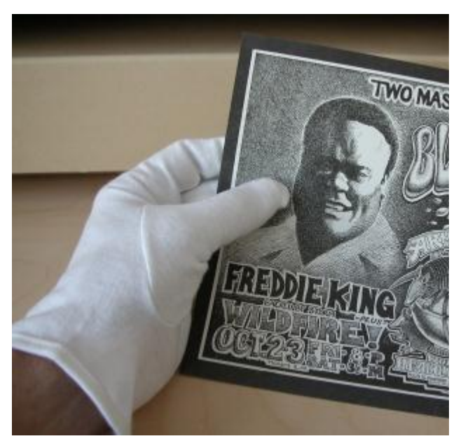
Cotton gloves are useful

Cotton Gloves -- Not needed for a lot day-to-day handling of posters, you may want them if you are handling very expensive or very old paper, since the transfer of body oils is more detrimental and the harm done more immediately visible. I use gloves for the very rare stuff.